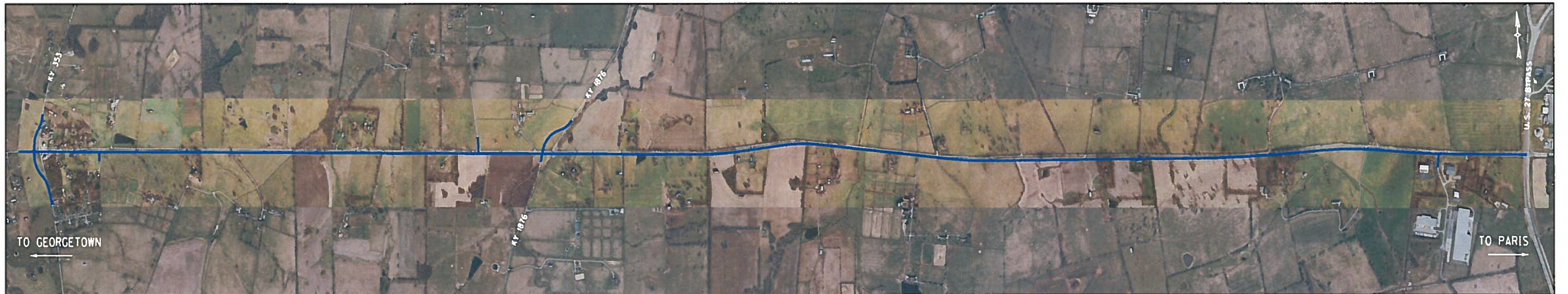
U.S. 460 ALTERNATE 2