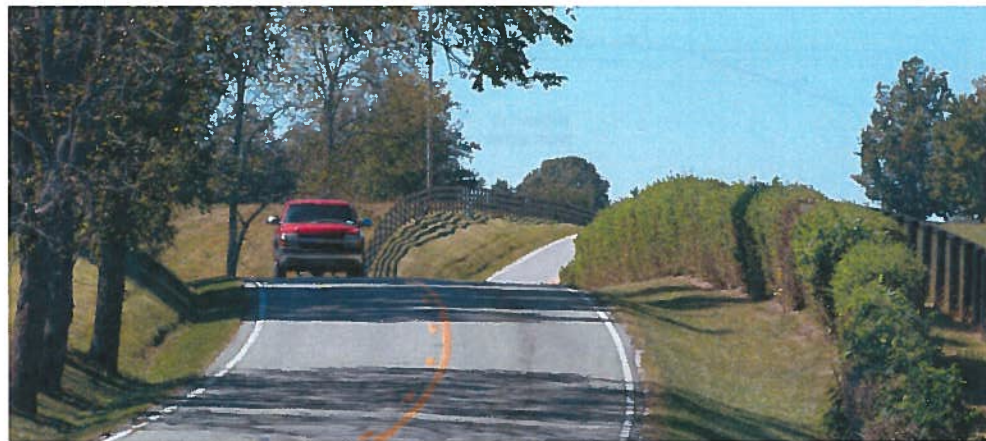
U.S. 460 LOOKING EAST