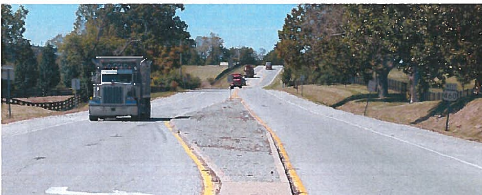
U.S. 460 @ U.S. 27 BYPASS LOOKING WEST