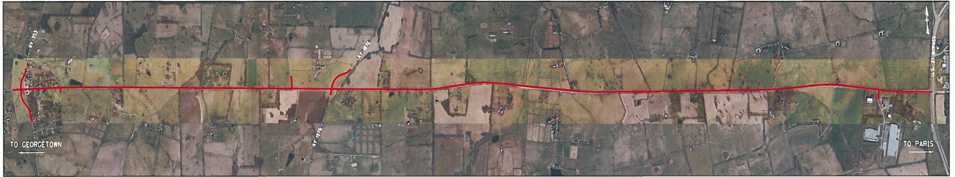
U.S. 460 ALTERNATE 1